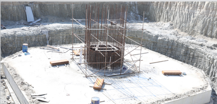
250,000 Gallons Underground Water Tank